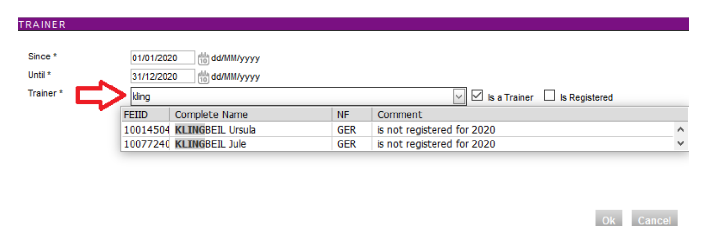
Step 3: Search for the Person you wish to add as a Trainer, by name or FEI ID number and choose the Person from the dropdown menu:

Please note: if the Person does not appear, they are perhaps not marked as a Trainer on their profile.